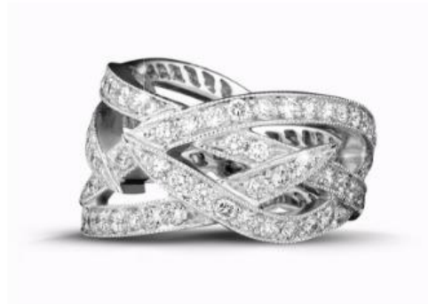
Diamond ring of Nathu collection, designers Wouters & Hendricks for BAUNAT

Right hand rings are designed more like cocktail rings , featuring clusters of smaller diamonds that run largely in north/south designs with lots of surrounding negative or open space. This is in contrast to the traditional three stone solitaires and solid wedding bands. Rings for the right hand are intended to showcase the happiness of a woman, worn on the fourth finger and sometimes the pinky.