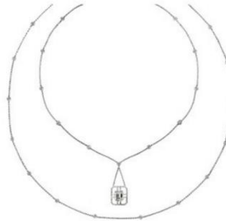
Diamond sautoir, custom made design by BAUNAT