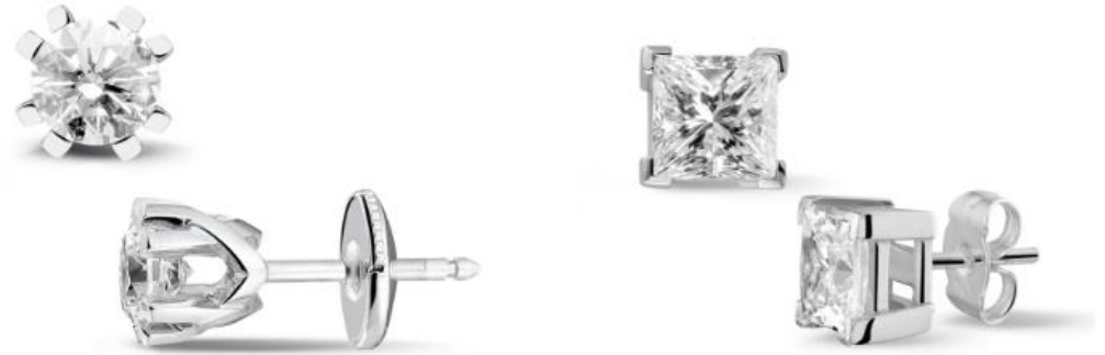
Round and princess diamond studs, BAUNAT's Classic Collection